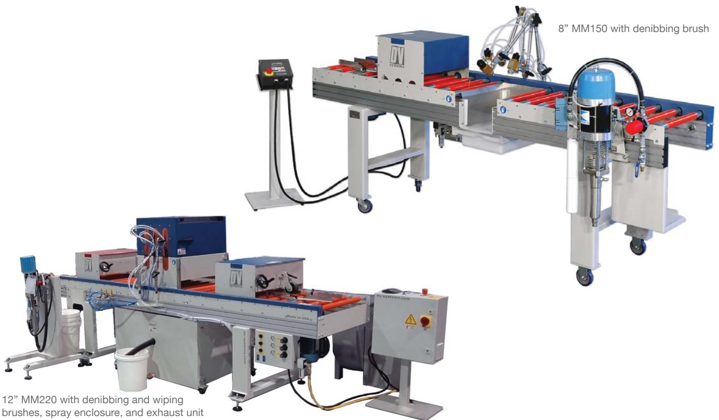
8" MM150 with denibbing brush